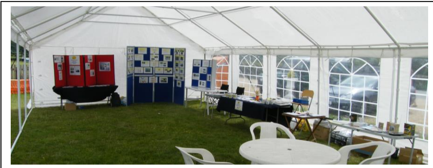
View of BNAPS display area and sales stand at the Summer BBQ