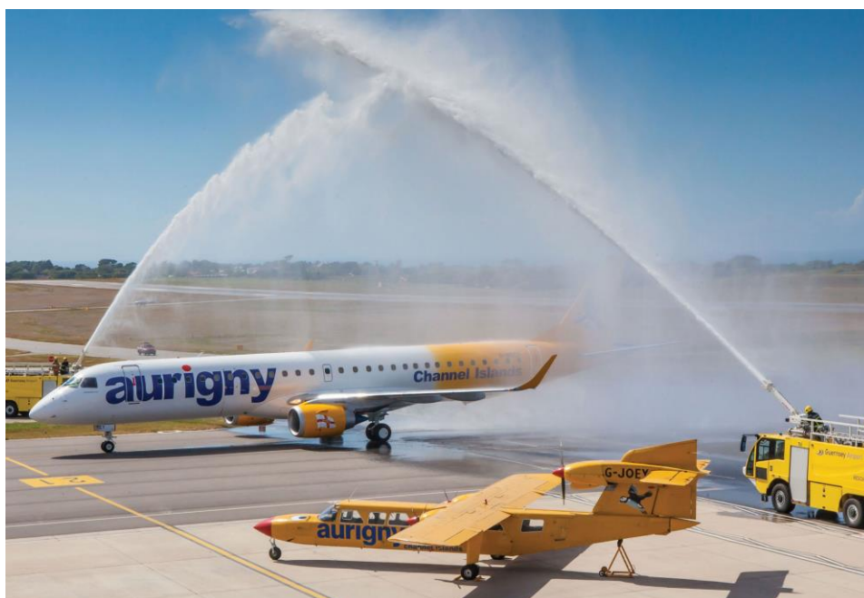
Aurigny Air Services Trislander G-JOEY looks on as the new Embraer 195 is given a traditional fire service welcome on arrival at Guernsey Airport

The Trislanders have been worked hard this summer to maintain the popular Guernsey to Alderney and Alderney to Southampton services. No date has been given for the transfer of these services to operation by the Dornier 228s. At present it is expected that the Trislanders will continue to be operated well into 2015.