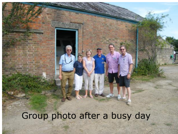
Group photo after a busy day