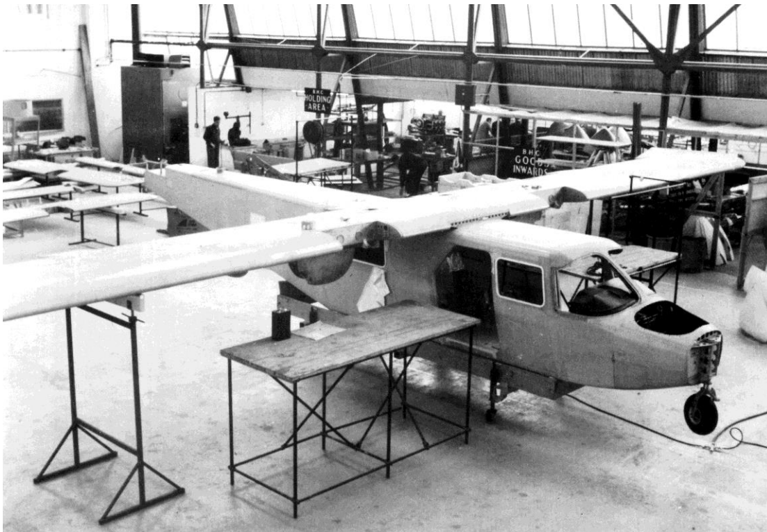
Completed wing and fuselage components were delivered by road to BHC's Goods Inwards Section at B-N's Bembridge Works. This view shows an aircraft in the initial stages of being assembled.