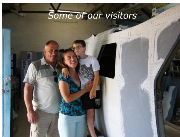
Some of our visitors