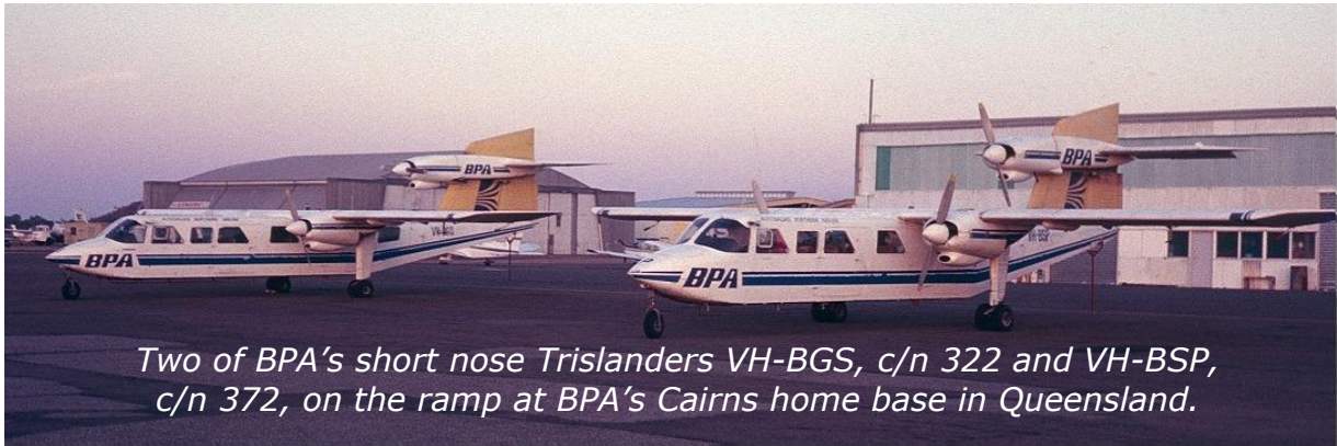
Two of BPA's short nose Trislanders VH-BGS, c/n 322 and VH-BSP, c/n 372, on the ramp at BPA's Cairns home base in Queensland.