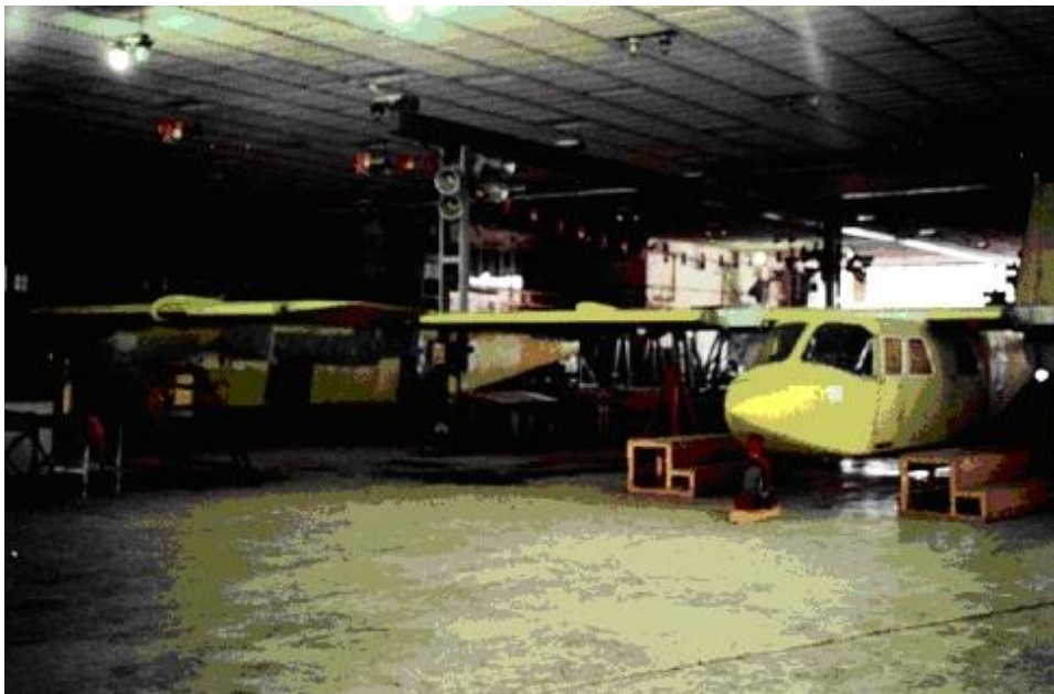
Final assembly area at the Romaero factory.