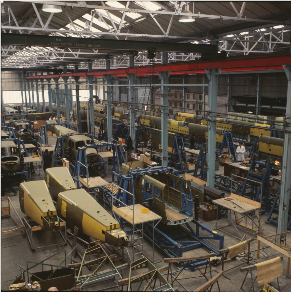
A rare colour photograph of BHC's Falcon Works. The Islander fuselage assembly area can be seen in the foreground and the wing production line in the background.