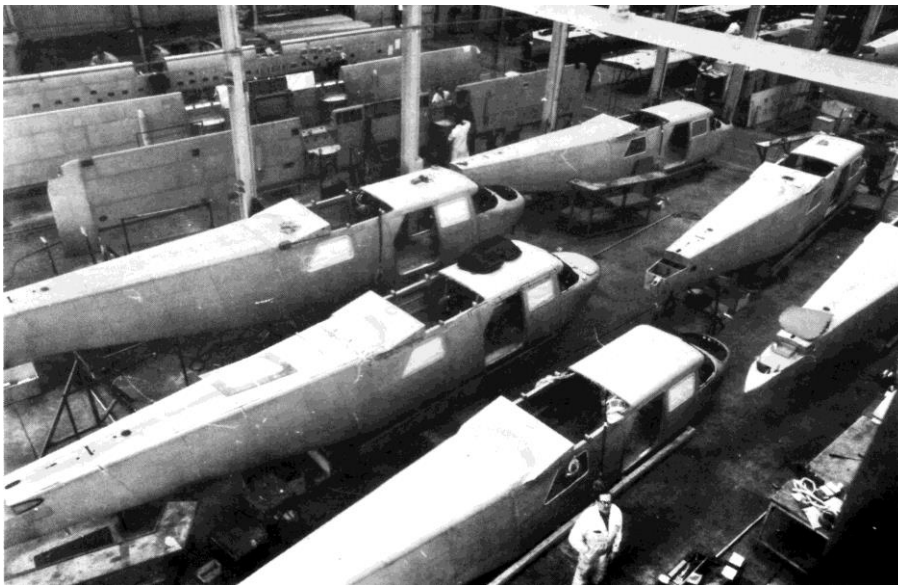
Islander fuselage production line at BHC's Falcon Works, East Cowes.

The following photos show Islander fuselage and wing production under way at BHC's Falcon Works at East Cowes and the Islander final assembly area at Bembridge: