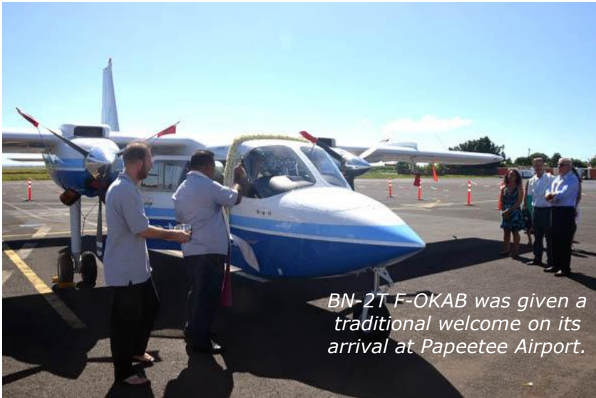
BN-2T F-OKAB was given a traditional welcome on its arrival at Papeete Airport.

After a 90 Hour delivery flight Air Tetiaroa's first BN-2T Islander, F-OKAB, c/n 2310, arrived in Tahiti at the end of May, 2015, in good time for the start of a new service on 1 July, 2015.