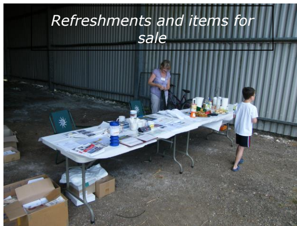
Refreshments and items for sale