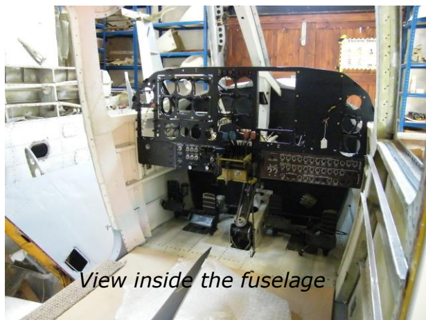
View inside the fuselage