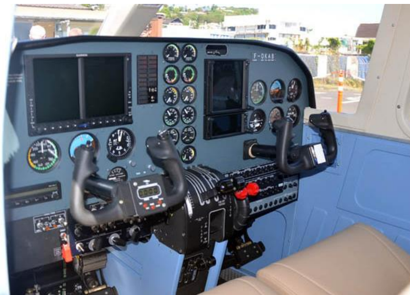
View of the latest digital instrument panel for Air Tetiaroa's BN-2T, F-OKAB.

Two BN-2T Islanders were ordered in 2012 to convey visitors to and from the exclusive Brando resort located on part of the Tetiaroa atoll. The flight to the Brando resort from Tahiti's main airport at Papeete takes about 20 minutes.