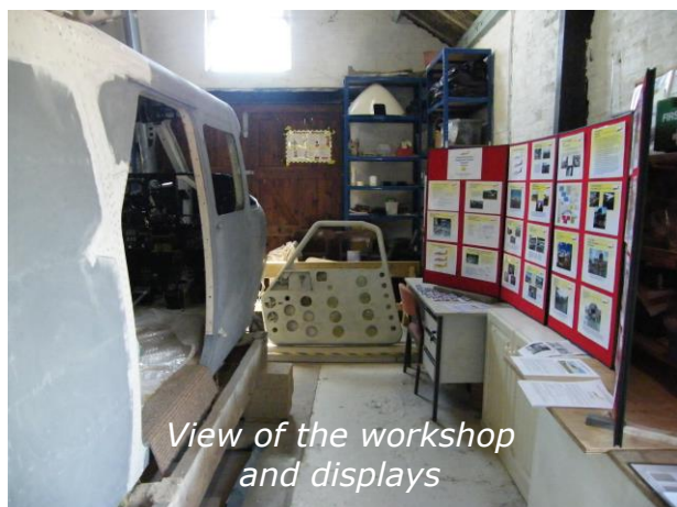
View of the workshop and displays