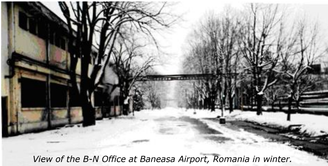
View of the B-N Office at Baneasa Airport, Romania in winter.

On 4 September 1969, the first Romanian-built BN-2 Islander G-AXHY, (c/n 601), assembled from a kit supplied by B-N, made its first flight, and was delivered to Bembridge 18 days later. A target production rate of four aircraft per month was expected initially and it was not long before aircraft were being turned out at a rate of one every ten days. The entire output of completed aircraft was purchased by B-N who remained responsible for all Islander sales.