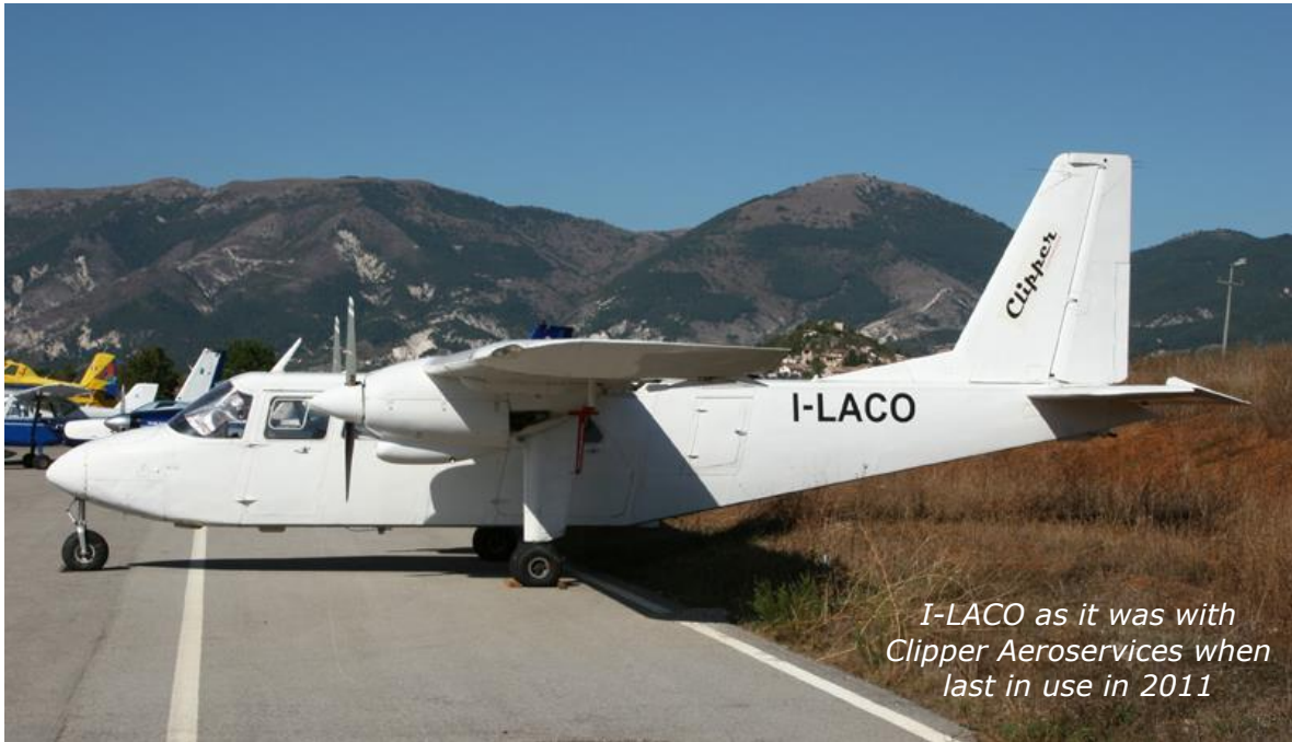
I-LACO as it was with Clipper Aeroservices when last in use in 2011

Perhaps it is over sentimental to think that c/n 17 could be repatriated but stranger things have happened in the world of aviation. If anyone knows more about the fate of I-LACO we would be pleased to hear any news.